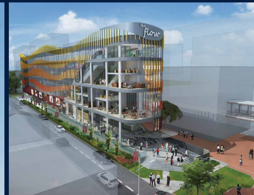
5th & 6th Storey